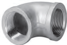
BSP 90 ELBOW