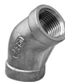
BSP 45 ELBOW