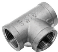
BSP EQUAL TEE