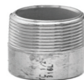
BSP WELDING NIPPLE