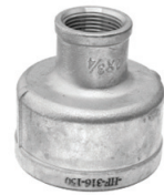
BSP RED SOCKET