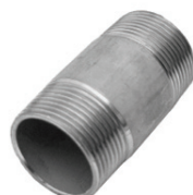
BSP BARREL NIPPLE