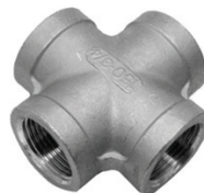
BSP EQUAL CROSS