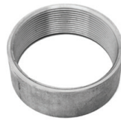
BSP HALF SOCKET