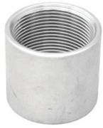
BSP FULL SOCKET