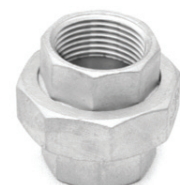
BSP HEXAGON UNION