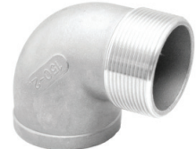
MALE/FEMALE 90 ELBOW